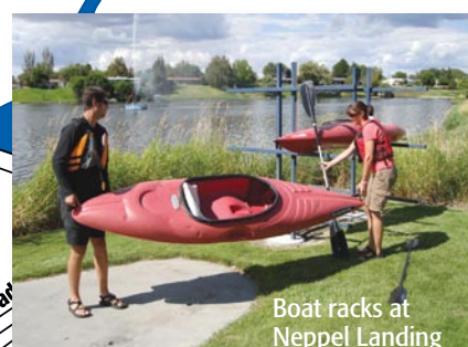
Boat racks at Neppel Landing