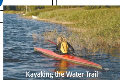
Kayaking the Water Trail