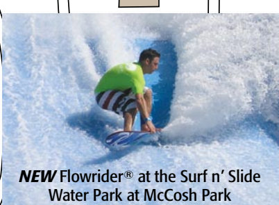
NEW Flowrider® at the Surf n' Slide Water Park at McCosh Park