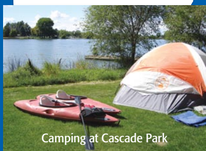
Camping at Cascade Park