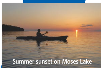
Summer sunset on Moses Lake