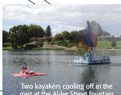
Two kayakers cooling off in the mist at the Alder Street fountain