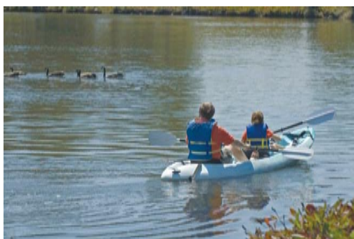
Kayaking in front of John Calbom Park